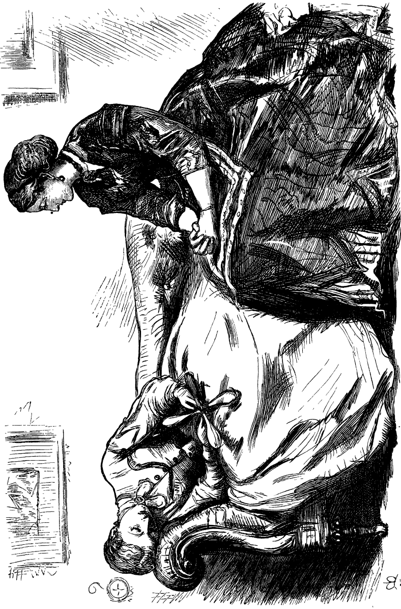
"I wish you would be in earnest with me."